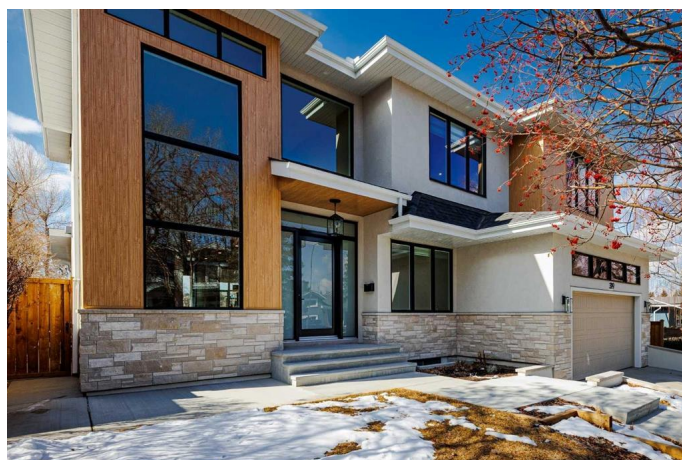
319 42 St SW, Calgary, AB