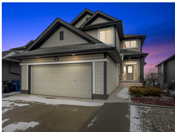
48 Sunset Cl, Cochrane, AB

Step inside to find a sun-filled interior, with large windows framing the breathtaking mountain vistas. Hardwood floors lead you from the welcoming foyer into the expansive living space, where the kitchen, dining, and living room flow seamlessly together. The gourmet kitchen features beautiful cabinetry, a large wrap around eat-up island that easily sits 8, granite countertops, stainless steel appliances, ample pantry space—perfect for both cooking and entertaining. Off the large kitchen dining, an patio space ideal for hosting barbecues, reading a book or simply enjoying the stunning mountain views, sunsets and nature at large. The cozy living room includes a gas fireplace, setting the tone for a warm and inviting space to relax during our cold winter months and Central A/C for our hot summer months.